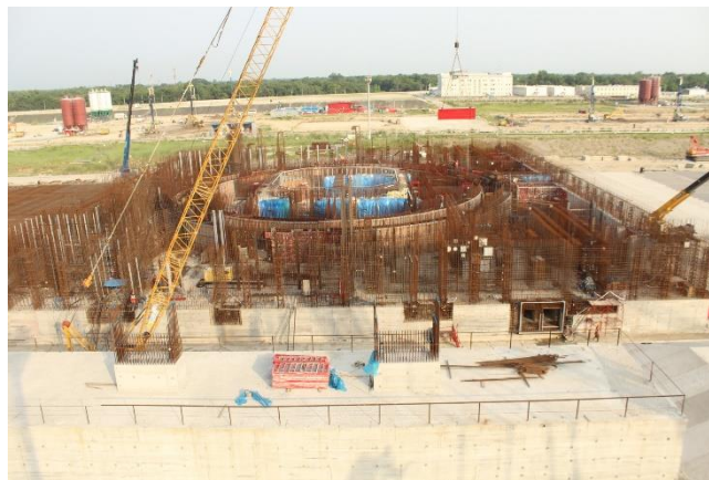
Figure 2: Construction activities at the Unit-1 of Rooppur NPP up to the ceiling level of 0.000

The concreting pouring works for the foundation plate of Unit-1 has been completed with due compliances of the design requirements, licensing conditions of Design and Construction Licence of Unit-1 and all other regulatory requirements of BAERA. Based on the final safety status report of the concreting works and all justification documents on civil engineering structures of the reactor building and Chapter 3 of the PSAR for Rooppur NPP, the BAERA granted approval of continuation of the activities at the Reactor Building of Rooppur NPP Unit 1 up to the ceiling level of 0.000 as per the design on June 10, 2018 . Presently, the civil and construction works for development of the containment walls, outer walls, inner walls, reactor pit walls, core catcher placement foundation and core catcher walls are being performed. The First Unit of Rooppur NPP will be producing electricity on experimental basis at the beginning of 2023, provisional take over and final takeover at the end of 2023 and 2024, respectively.