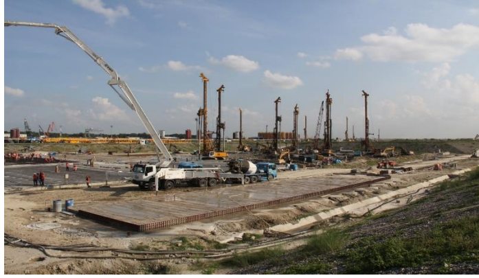
Figure 3: Completion of Reinforcement works ready for First Concrete Pouring Unit-2 of Rooppur NPP

The soiling stabilization works under Rooppur NPP Unit-2 have been commenced and the final safety status report of the Reactor Building of Unit-2 (20UJA) prepared and submitted to BAERA for granting Design and Construction License for Rooppur Nuclear Power Plant Unit-2. The Authority granted the Design and Construction Licence for Rooppur Nuclear Power Plant Unit-2 on July8, 2018. All necessary works including reinforcement works have been completed and this unit is ready for celebrating the FCD ceremony of the Unit-2 of Rooppur NPP on 14 July 2018 in presence of Hon'ble Prime Minister of Bangladesh.